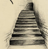
DOG LEAP STAIRS