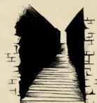
THE LONG STAIRS